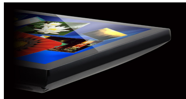
Flat Front Surface (Virtual Bezel)