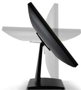
90-degrees of Adjustment