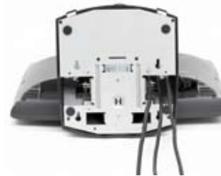
"Cable-Through-Bottom" routing option for seamless counter or wall installation